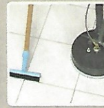
Tile & Grout Cleaning