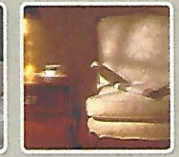
Magi-Seal Lifetime Fabric Protection