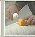
Leather Care & Restoration