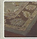
Fine Area Rug Cleaning