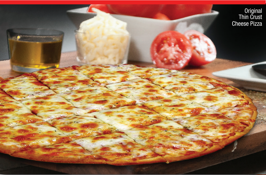
Original Thin Crust Cheese Pizza

When ordering 1/2 ingredient, you only pay 1/2 the ingredient price!