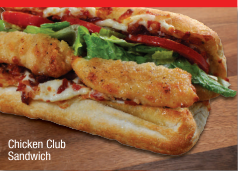
Chicken Club Sandwich