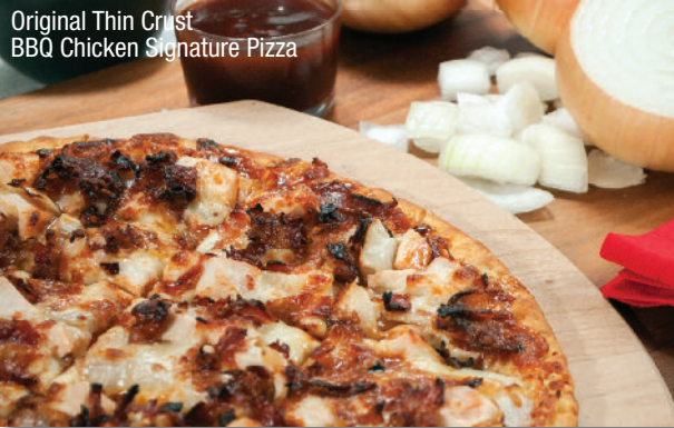
Original Thin Crust BBQ Chicken Signature Pizza