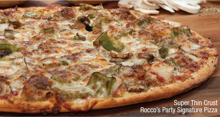
Super Thin Crust Rocco's Party Signature Pizza

It is our commitment to you that when it's time for pizza or pasta, you can count on Nancy's Pizza for the highest quality and freshness.